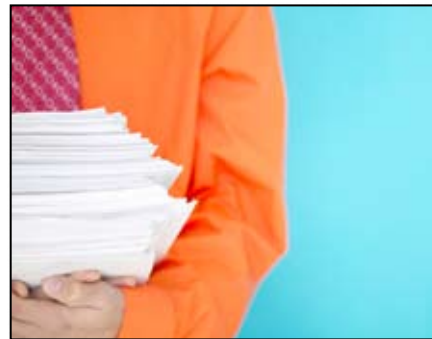
Sage Abra has many tools that can increase your efficiency and save you money in your quest for a paperless payroll.